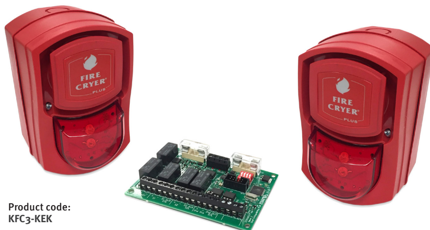
Product code: KFC3-KEK